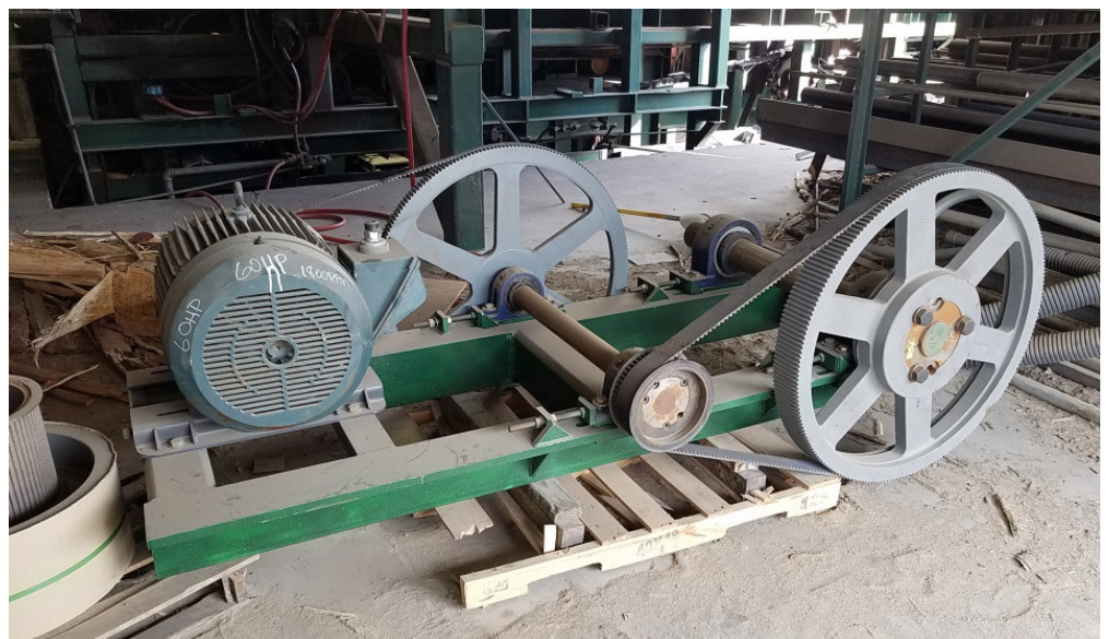
60 HP double reduction 17:1. Drive platform staged for install.

These polyurethane belts, unique to Gates, are made with carbon fiber tensile cord and an anti-friction nylon tooth surface. The advanced materials used in this belt construction mean they require zero maintenance aside from simply greasing the bearings, and offer years of service. Other manufacturers make synchronous belts, but most are rated at 50 percent or less than Poly Chain, making them wider, more costly, and they take up more space.