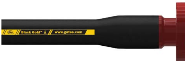
API FLANGE ENDS