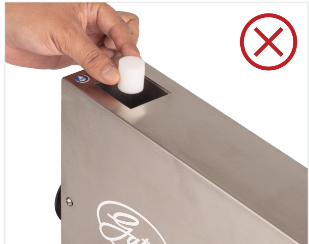
Incorrect Loading of the Projectile