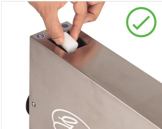
Correct Loading of the Projectile

Ultra Clean Projectiles should ONLY be dropped through the top opening on the Bench Mount Launcher in a horizontal fashion for optimal performance. The Projectile can only be dropped through top opening in this manner (as shown) due to the size of the projectile and the top opening of the launcher. Failure to do so will cause the projectiles to jam.