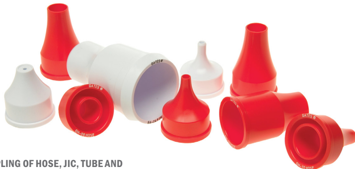
SAMPLING OF HOSE, JIC, TUBE AND FFORX NOZZLES